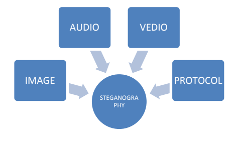
Figure 1. Steganography Types